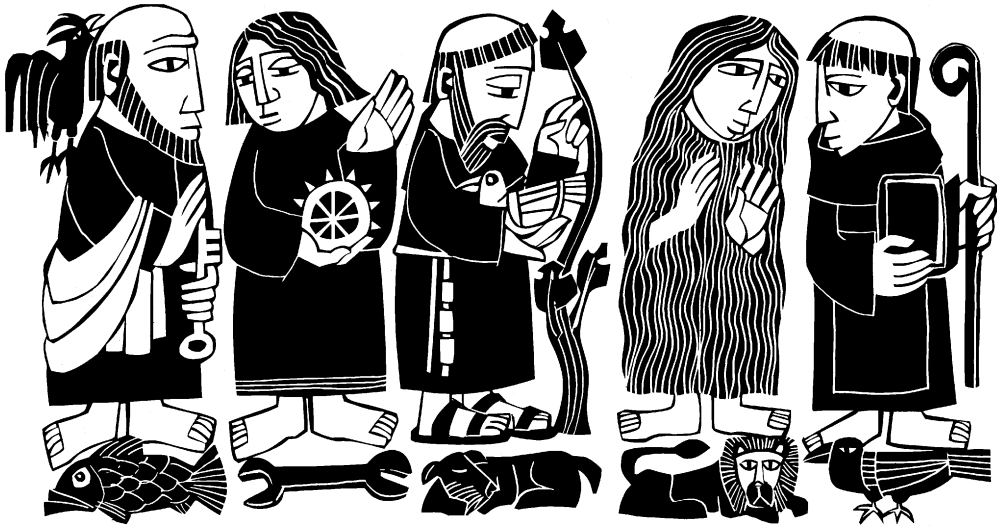
Pictured from left to right: St Peter; St. Catherine of Alexandria, St. Francis of Assisi, St. Mary of Egypt and St. Benedict of Nursia.